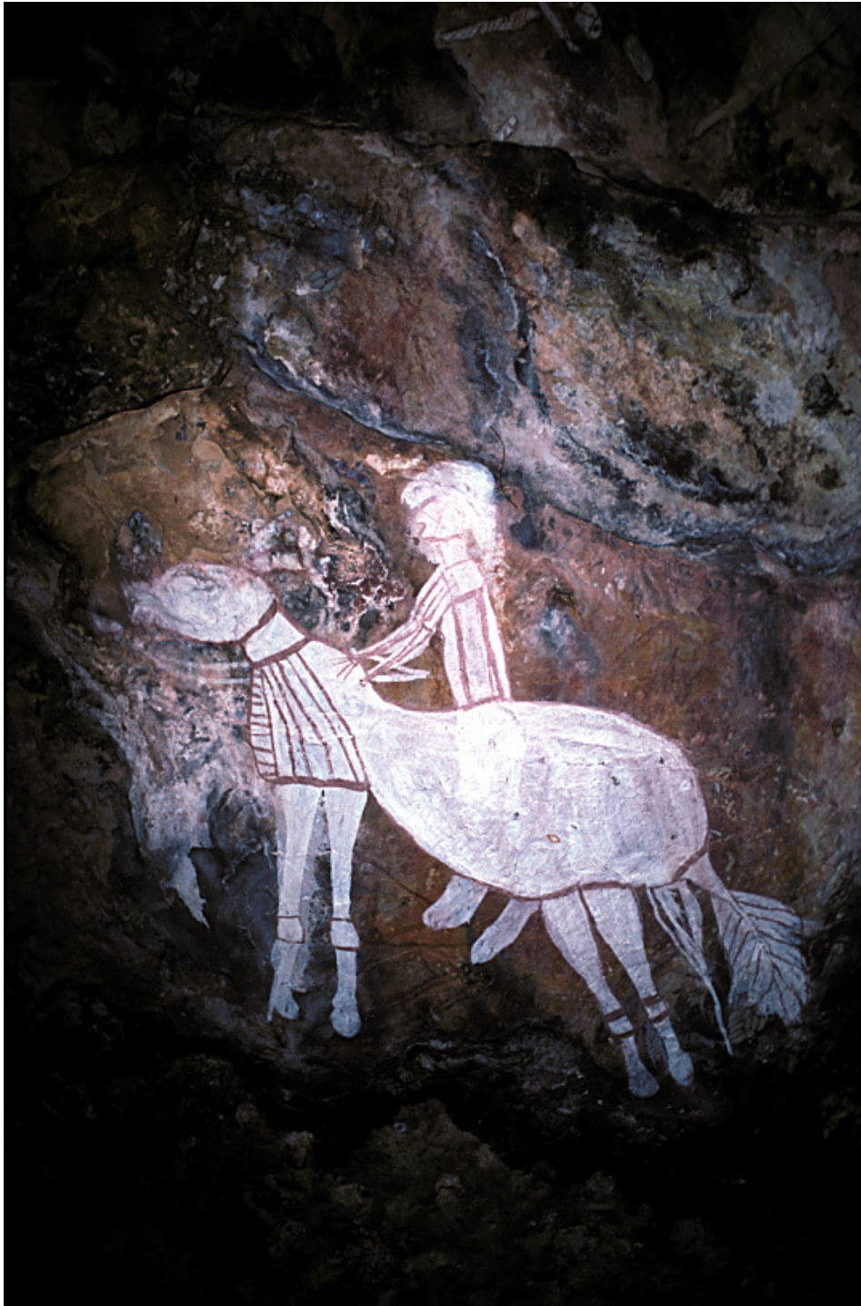
A Unique 'first' painting of a man on horseback wearing a helmet (Leichhardt's straw hat) near Leichhardt's path in Kakadu National Park .

bounded the sandy flats, until my companions brought my share of stewed green hide.” (Ludwig Leichhardt 18 November 1845)