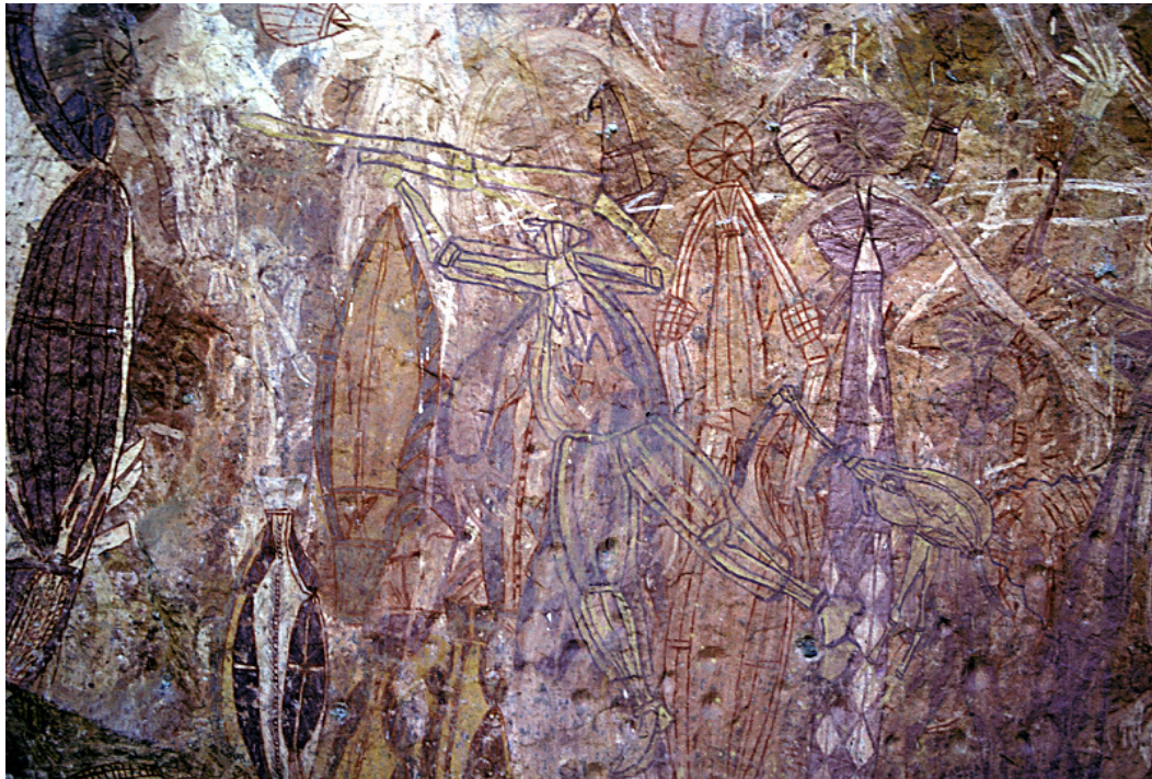
Paintings of a man wearing a tie using his rifle as a spear near Jim Jim Creek.