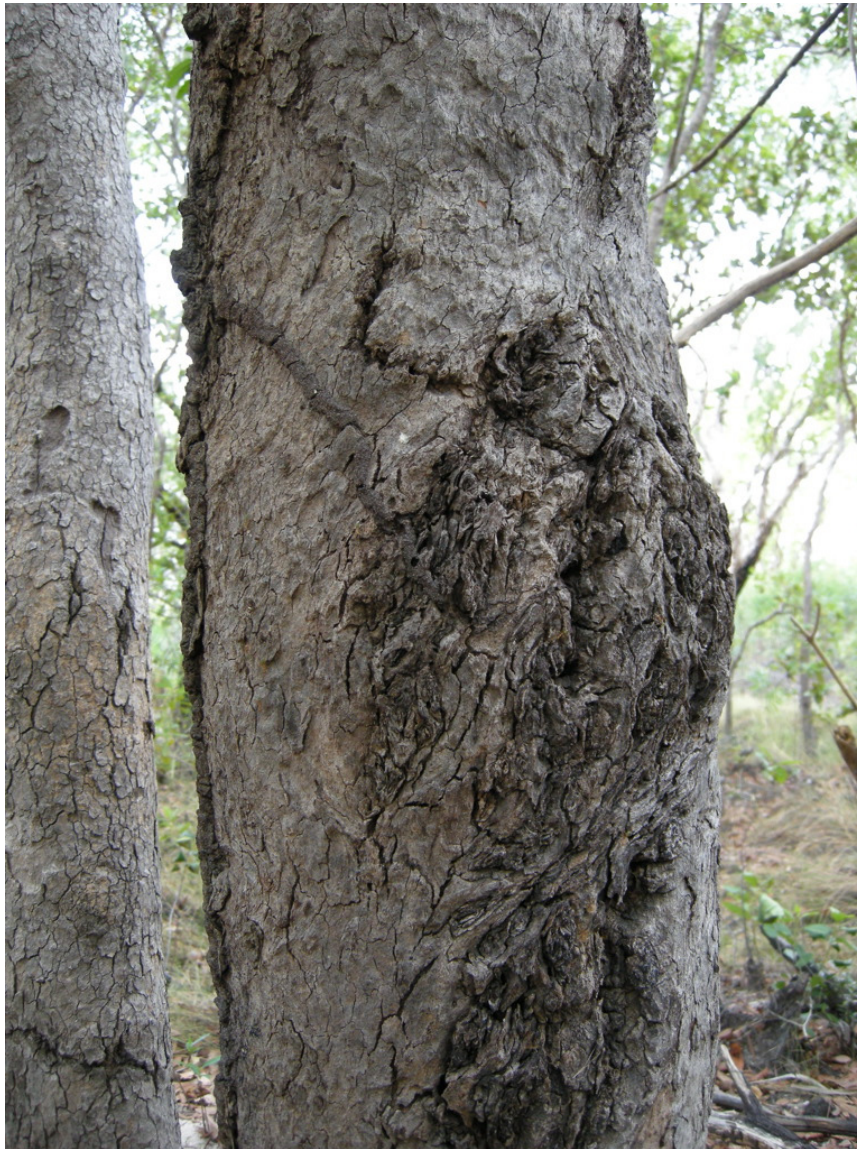
There it was an ancient ‘LL’ blaze – so old that had we not been looking for it we would have missed it entirely.

On looking around we found what we also thought were old rope burns, and ancient cuts and slashes on the trees nearby but on a follow up survey with archaeologist Douglas Hobbs these proved to be a type of termite furrowing. However – had we found Leichhardt’s camp exactly where he said it would be...?