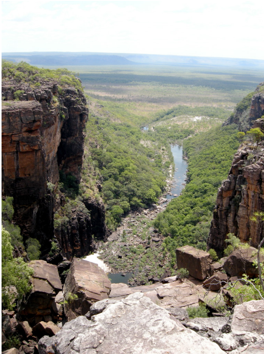
The view atop Jim Jim waterfall looking out to the South Alligator valley "...a pristine ribbon of blue..."